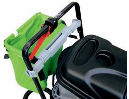
Rear waste bin