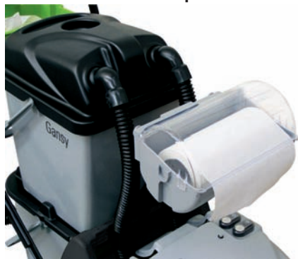
Paper towel holder